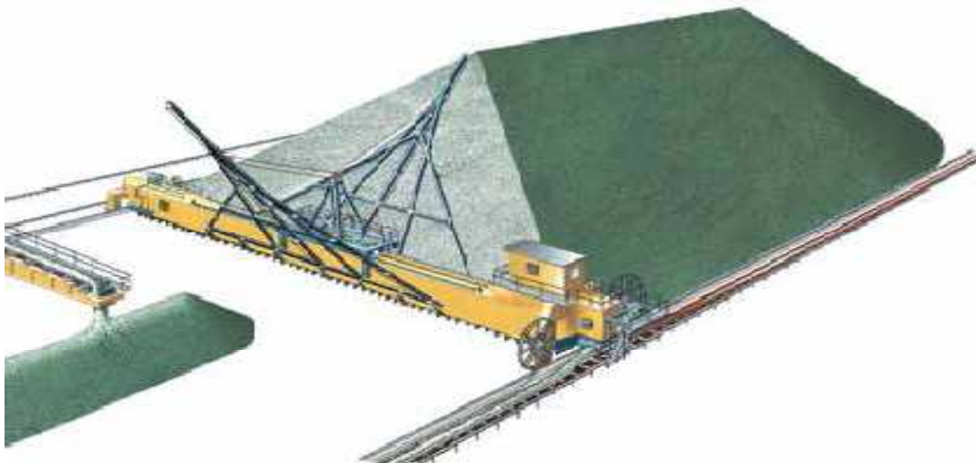
Figure 3.1: Stacker and Reclaimer

The reclaimer system consists mainly of a chain conveyor which can be moved on the rails through 360 degree. A harrow drive is used to regulate the quantity of the material to be extracted by adjusting the cutting angle. The extracted limestone is conveyed to limestone hopper by using a belt conveyor. After crushing, several additives like sweetener limestone and laterite are also fed to the respective hoppers.